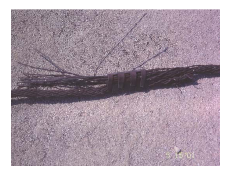
Figure 9. Frayed conductor strands at a conductor splice. In this condition, the roof membrane is vulnerable to puncture.

-- Membrane puncture: When conductors rest directly on a roof surface, frayed conductor strands, protrusions from splice plates and bolts protruding from cross-run clips can puncture membranes (see Figures 9 through 11).