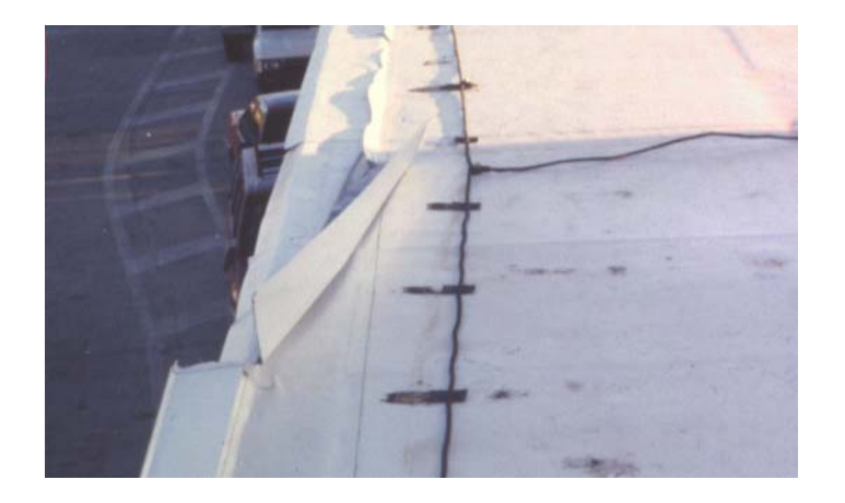
Figure 3. The conductors on this PVC membrane roof were attached with narrow strips of PVC sheet that were placed over the conductors and then welded to the roof membrane. In this area of the roof, the attachment strips were peeled off the roof membrane (the plane of failure occurred within the membrane, wherein the PVC matrix separated from the reinforcement).

Many manufacturers of roofing materials also provide some guidance pertaining to the interface between the roof membrane and lightning protection system. Some examples of membrane manufacturers' recommended details are as follows: