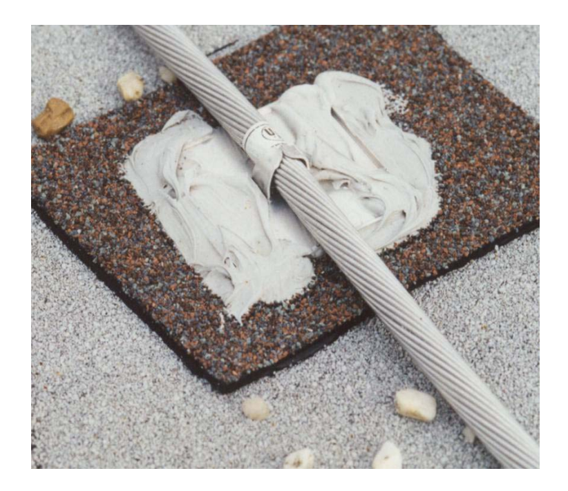
Figure 4. A pad of cap-sheet material was adhered to the mineral-surfaced membrane. The conductor was set in and covered with sealant.

-- SBS-modified bitumen membrane manufacturer: Install a pad of cap sheet (3 inches [75 mm] wider in all directions than the air terminal base or conductor connector) in hot asphalt, asphalt roof cement or by using a torch. Attach air terminals and conductor connectors in asphalt roof cement. Figure 4 illustrates a similar detail.