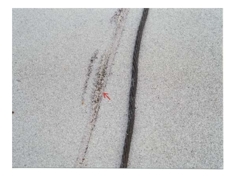
Figure 5. This conductor occurred on a white cap sheet in Florida. The conductor had previously been located to the left where marked by the arrow. At the previous location, the conductor had sunk into the membrane, thereby displacing the bitumen above the reinforcement.

Roof surface abrasion. Conductors resting directly on the roof surface can abrade the roof surface. On metal roofs, abrasion can result in loss of the corrosion protection and subsequent corrosion-induced penetration of the metal. Loss of protective granules or wearing away of polymer matrices can shorten the roof's service life. Surface abrasion can be accelerated if the distance between conductor connectors is excessive due to lack of connectors (see Figure 6) or if a connector was not attached (see Figure 7) or becomes detached from the roof (see Figure 8). Accelerated abrasion can also occur on roofs located in areas prone to frequent or prolonged wind events that are sufficient to cause movement of the conductors between connector points.