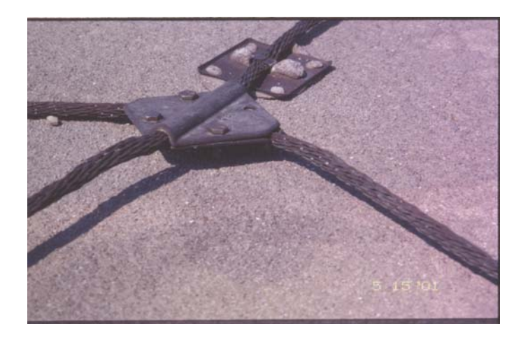
Figure 11. The bolts through this cross-run clamp are resting on the roof membrane. A conductor connector occurs near the top of the photo. It was attached to the membrane with sealant.

Figure 10. This conductor splice is upside down. One of the prongs of the splice plate was not clamped to the conductor -- the prong is resting on the roof membrane. As with the condition shown in Figure 5, the membrane is vulnerable to puncture by the frayed strands and splice prong.