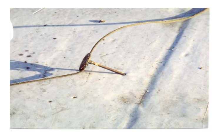
Figure 12. This air terminal was dislodged and whipped around during a hurricane. The single-ply membrane was punctured by the sharp tip in several locations.

Air terminals that become dislodged during wind storms can also puncture the membrane (see Figure 12).