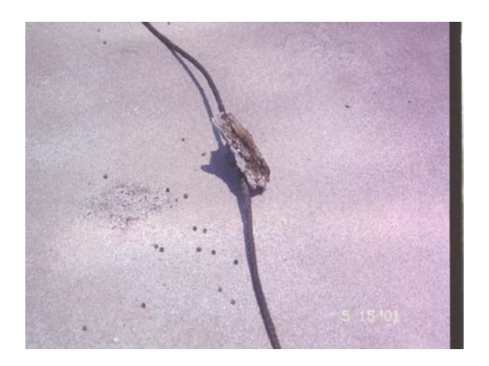
Figure 7. This is the upside-down base of an air terminal (the terminal rod is missing). The base had previously been adhered to a built-up membrane -- it had not been adequately cleaned and readhered to the new SPF roof.