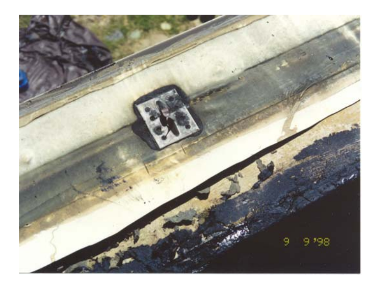
Figure 15. In this area, the conductor pulled out from the conductor connector. The connector was adhered to the EPDM membrane.

Loss of lightning protection system integrity: When air terminals are blown toward the center of the roof or blown off the roof, the building no longer has adequate lightning protection.