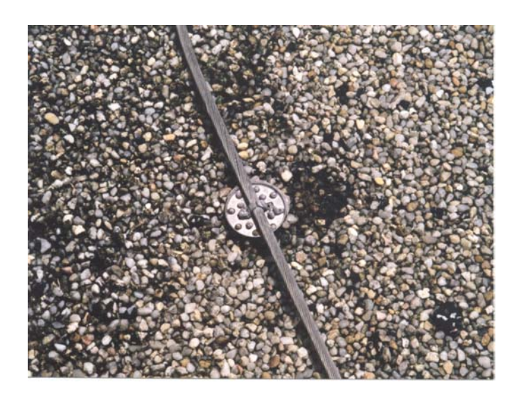
Figure 8. This conductor connector had been adhered in asphalt roof cement to an aggregate-surfaced BUR. Because the cement was applied to loose aggregate, the conductor could be easily moved.

-- Membrane puncture: When conductors rest directly on a roof surface, frayed conductor strands, protrusions from splice plates and bolts protruding from cross-run clips can puncture membranes (see Figures 9 through 11).