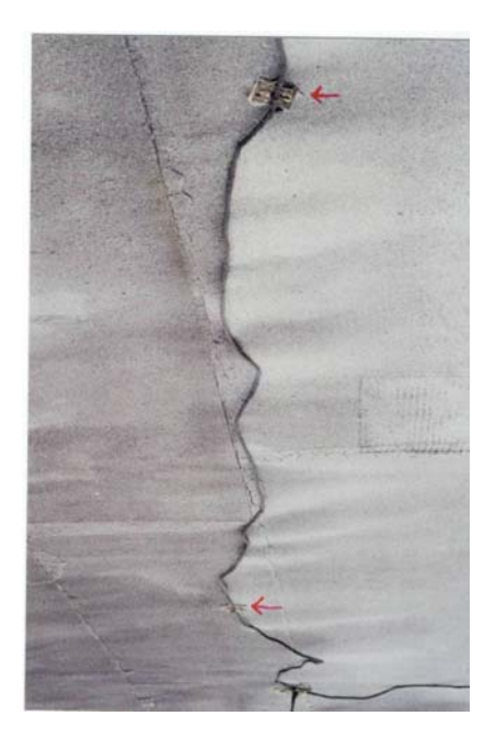
Figure 6. The spacing between these conductor connectors (shown by arrows near the top and bottom of the photo) greatly exceeded the 3 foot (915 mm) maximum requirement.