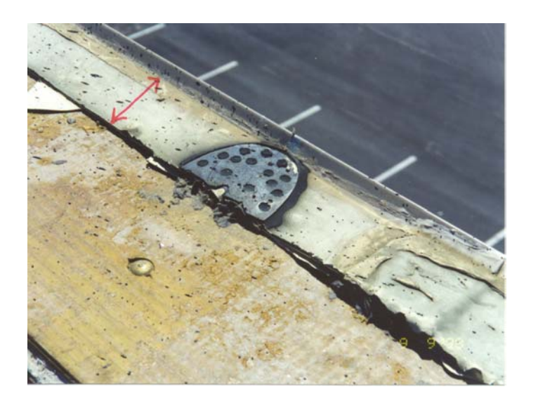
Figure 13. View of location where an air terminal base was adhered to an EPDM membrane. The arrows indicate the horizontal flange of the metal edge flashing. The conductor became dislodged during a hurricane. The loose conductor whipped and tore the membrane. The torn membrane was eventually lifted and peeled off the roof insulation. See Figure 14.

-- Membrane tearing and blow-off: Conductors that become dislodged during wind storms can tear membranes. During prolonged high winds, repeated slashing of the membrane by loose conductors and puncturing by air terminals can result in lifting and peeling of the membrane (see Figures 13 and 14).