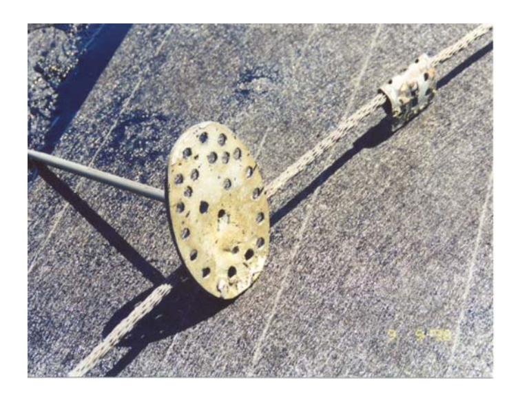
Figure 14. View of the underside of a dislodged air terminal. The failure plane was between the base plate and adhesive (i.e., an adhesive failure). See Figure 15.