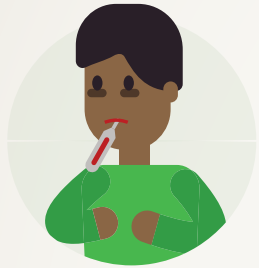
Fever* or feeling feverish/chills

*It is important to note that not everyone with flu will have a fever.