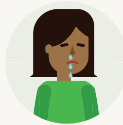
Runny or stuffy nose