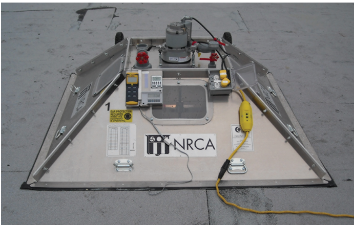
An example of a test chamber used for negative-pressure uplift testing

There are two recognized field test methods for determining adhered membrane roof systems' uplift resistances: ASTM E907, "Standard Test Method for Field Testing Uplift Resistance of Adhered Membrane Roofing Systems," and FM Global Loss Prevention Data Sheet 1-52 (FM 1-52), "Field Verification of Roof Wind Uplift Resistance."