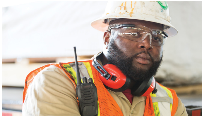
Customizable sample job description templates