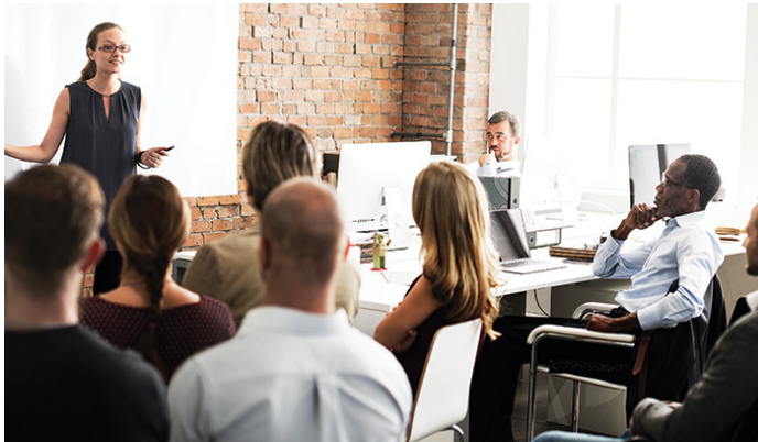
Explore worker training and PROCertification®